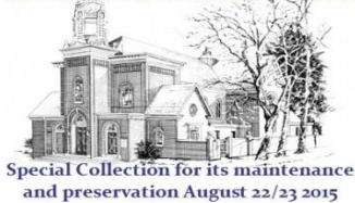
Special Collection for its maintenance and preservation August 22/23 2015

The Cathedral of Saint Peter is the Seat of the Diocese of Wilmington and the Bishop's own church. This beautiful and historic church is